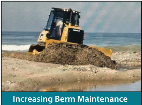
Increasing Berm Maintenance