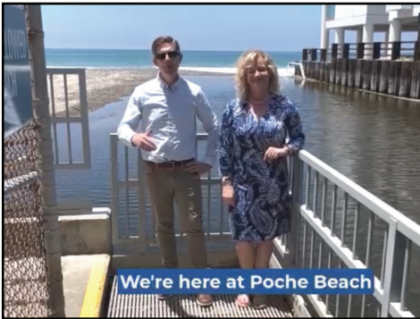
We're here at Poche Beach